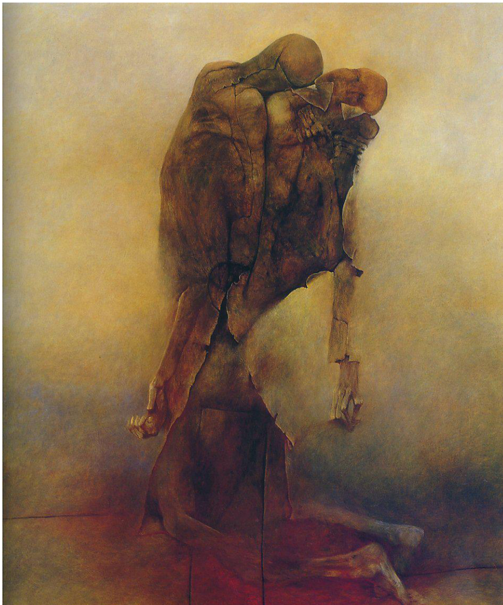
No. 10977, Zdzisław Beksiński, 1990